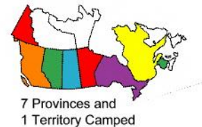
7 Provinces and 1 Territory Camped