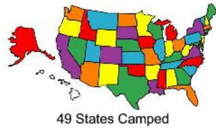
49 States Camped