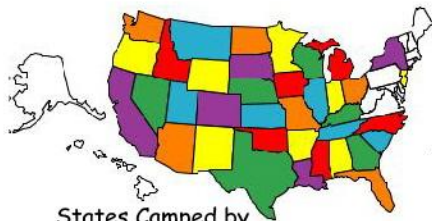
States Camped by The TropicCal Trio